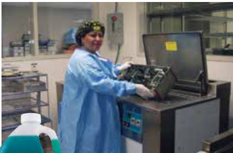
Reliable lab validated enzymatic action.