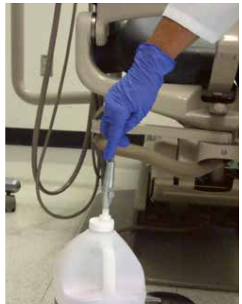
Non-foaming, biodegradable evacuation system cleaner.