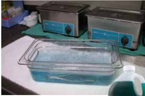
Powerful single enzyme detergent attacks protein soils.