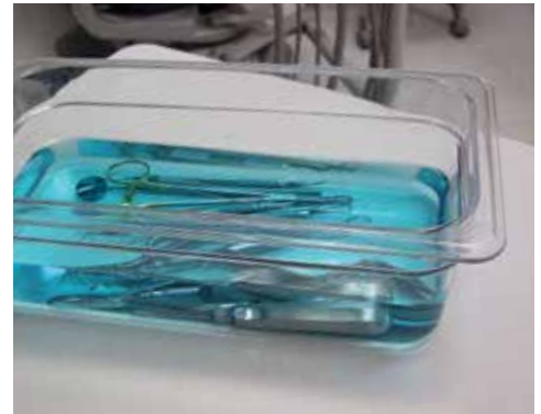
Versatile enzymatic cleaner for suction systems & instrument cleaning.