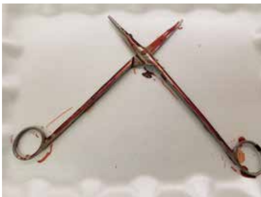
Instrument with heavy application bovine blood allowed to dry for two hours.