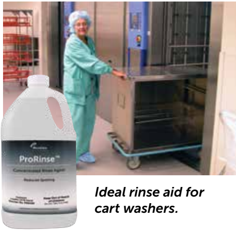
Ideal rinse aid for cart washers.