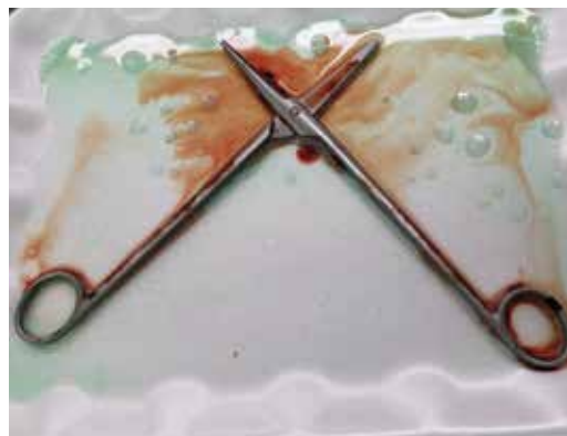
Bio-augmented cleaning action in ProEZ Gel™ starts dissolving bioburden including dried blood and continues protection during transit.